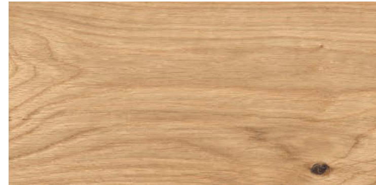
Plank 1-Strip Oak Elegant brushed 4V ID. no. 544592