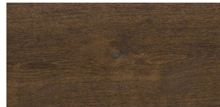
2-Strip Amber Smoked Oak brushed 4V ID no. 544598