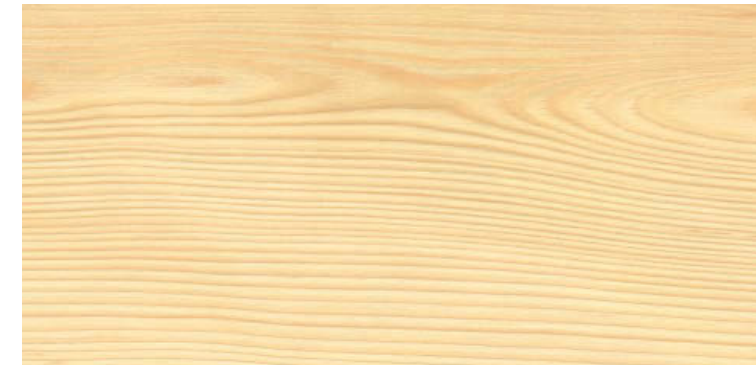
2-Strip Fir brushed 4V ID no. 544596