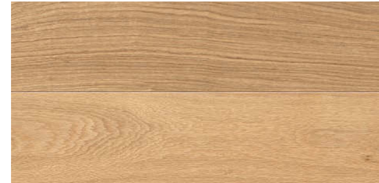
2-Strip Oak Elegant brushed 4V ID. no. 544593