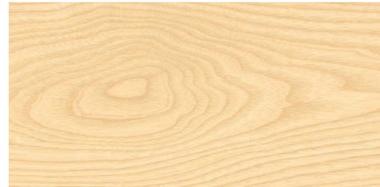
Plank 1-Strip Ash brushed 4V ID no. 544597