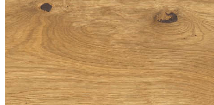
Plank 1-Strip Oak Natural brushed 4V ID no. 544594