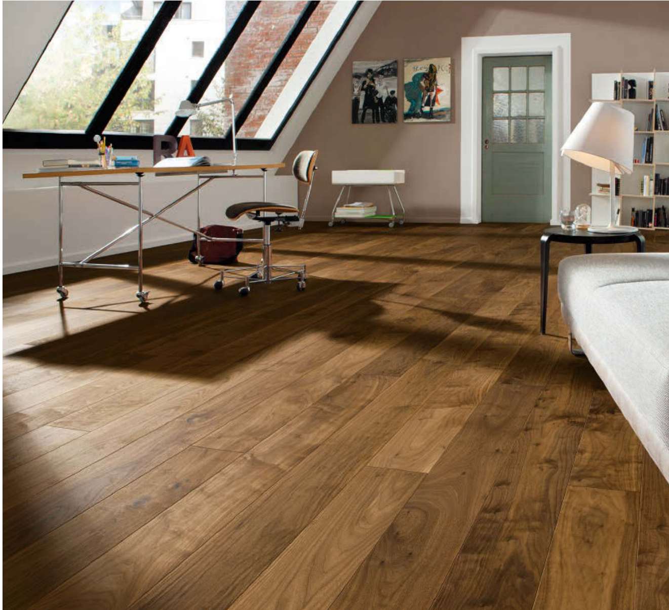
Plank 1-Strip American Walnut brushed 4V

All MULTIVO real-wood surfaces have one thing in common: Natural beauty for your home.